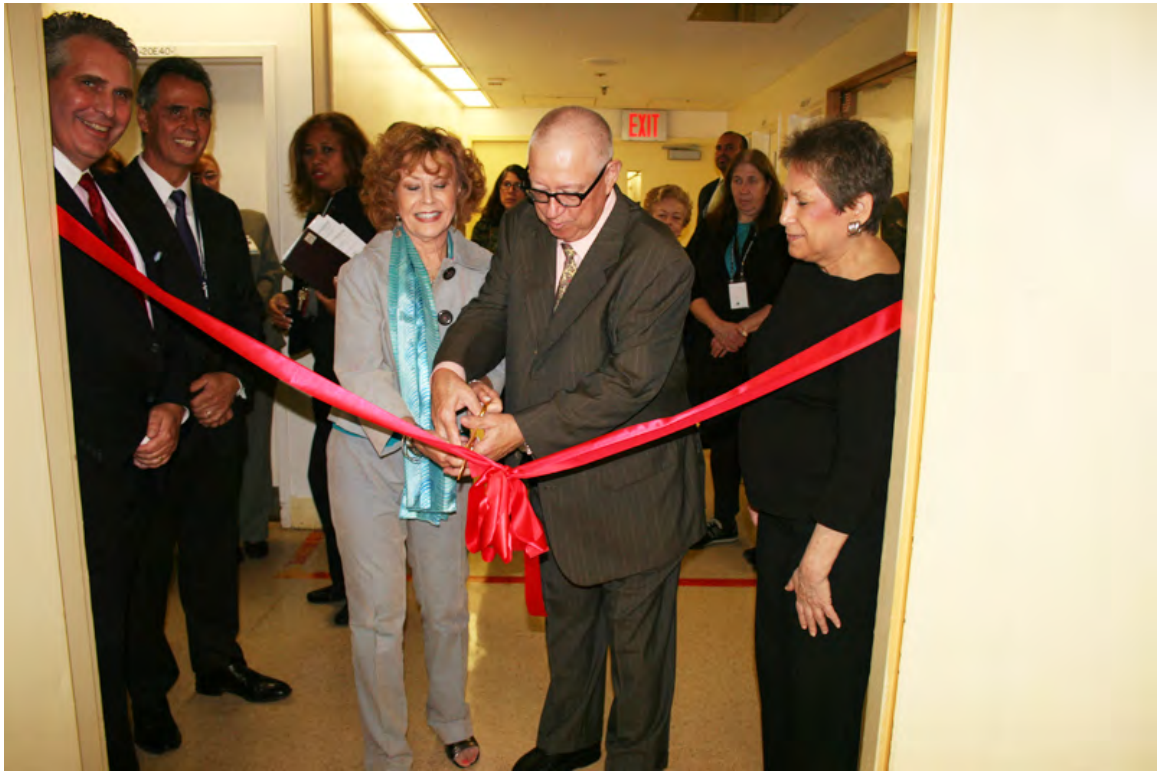
RIBBON CUTTING 20E DAYROOM